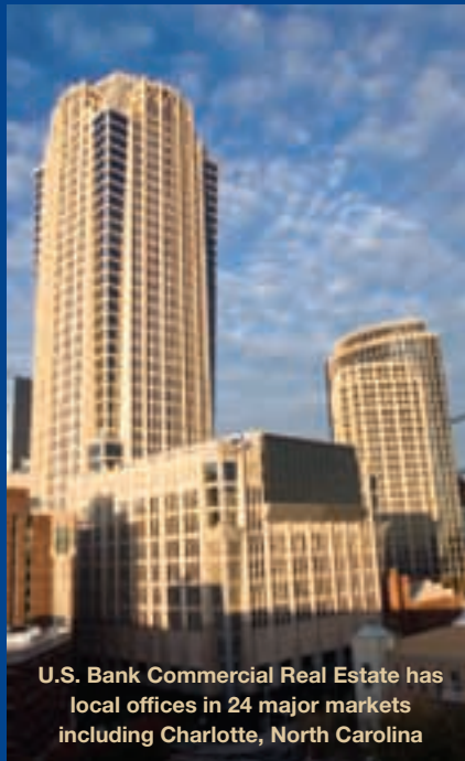
U.S. Bank Commercial Real Estate has local offices in 24 major markets including Charlotte, North Carolina

Bank with a financial partner that's strong and stable, safe and sound — that's U.S. Bank. Throughout this difficult economic environment, U.S. Bank has been open for business , lending money to our customers and offering the best financial services in the industry. We're honored by the many accolades U.S. Bank has received in the past year for our prudent, responsible way of doing business — putting the customer first , strengthening our bank and investing in the products and services that you and your business want and need. We lead among our peer banks in many key measurements of bank performance and soundness. All of US are working to help see our customers, our communities and our nation back on solid footing with unlimited opportunity and optimism again.